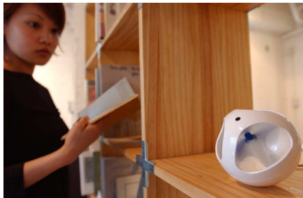
Figure 2: anemo.

“anemo” detects sounds within a room and triggers its counterpart’s propeller to spin. “anemo” spins in sync with conversation or music in the other room. As the sounds grow louder, “anemo” spins faster.